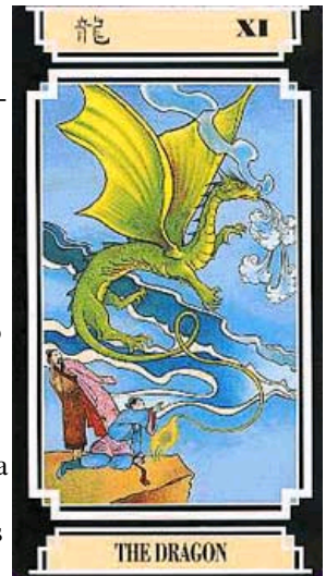
From the Golden Dragon Tarot

In conclusion, a word to the wise... Readers, consider well what information someone is really asking for in a reading. Seekers, use divination to assist you in your life and choices.