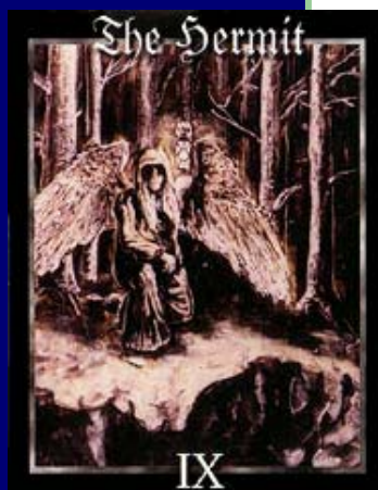
Hermit from the Guardian Tarot