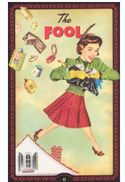
The Devil and Fool cards from the Housewives Tarot deck.

http://www.aeclectic.net/tarot/cards/housewives/index.shtml