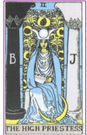
The High Priestess Rider-Waite deck