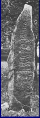
Divination using magickal a alphabet engraved on stones (answer on Page 4)